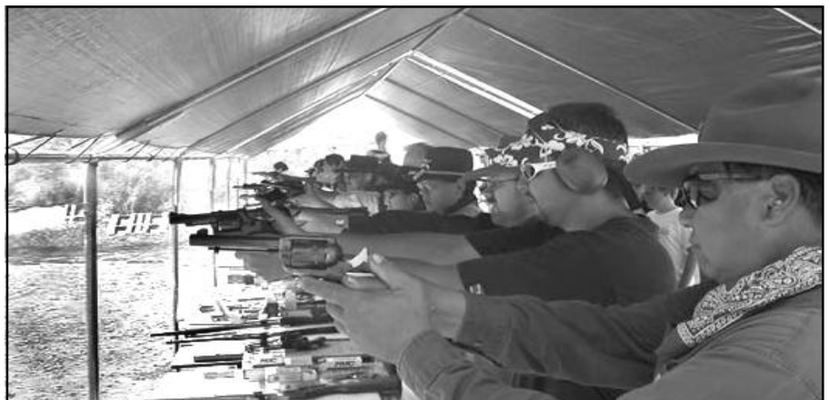
ABOVE: Action during the Stake-Break contest... we sure put on a good show!