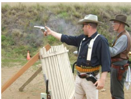
Duelist vs. Traditionalist? You be the